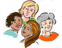
Ladies Coloring Night

Ladies do you like to create beautiful artwork? Do you like to color? Let's de-stress and create artwork that expresses our Christian faith. Please join us and bring a snack to share plus your coloring supplies. We will have some supplies available for sharing. Please sign up in the narthex.